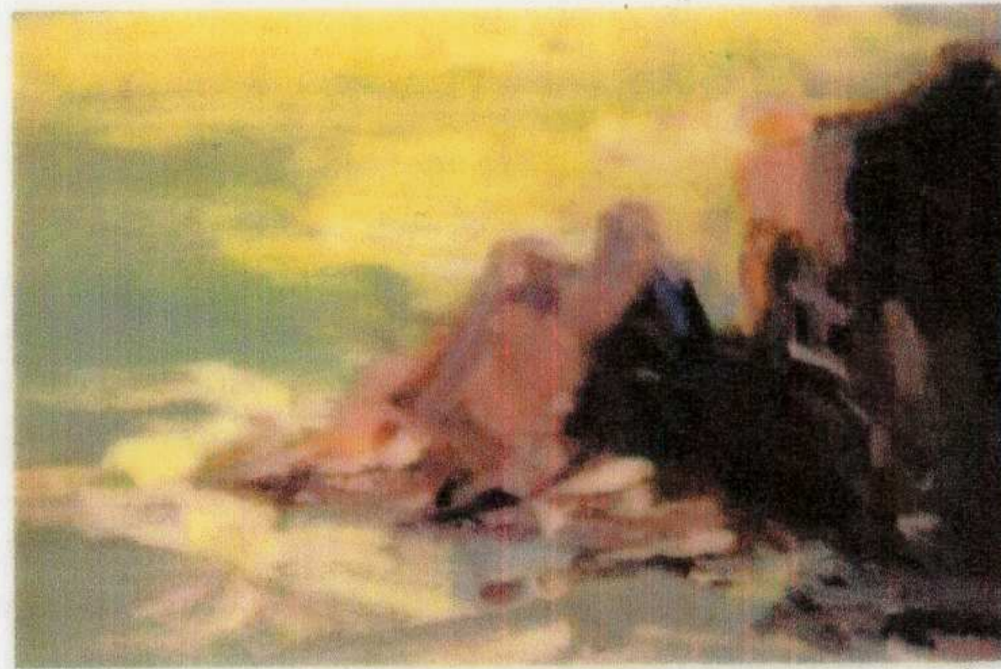
Coast in Italy Oil on panel 23 x 33cms

To view all the paintings exhibited go to www.bebbfineart.co.uk