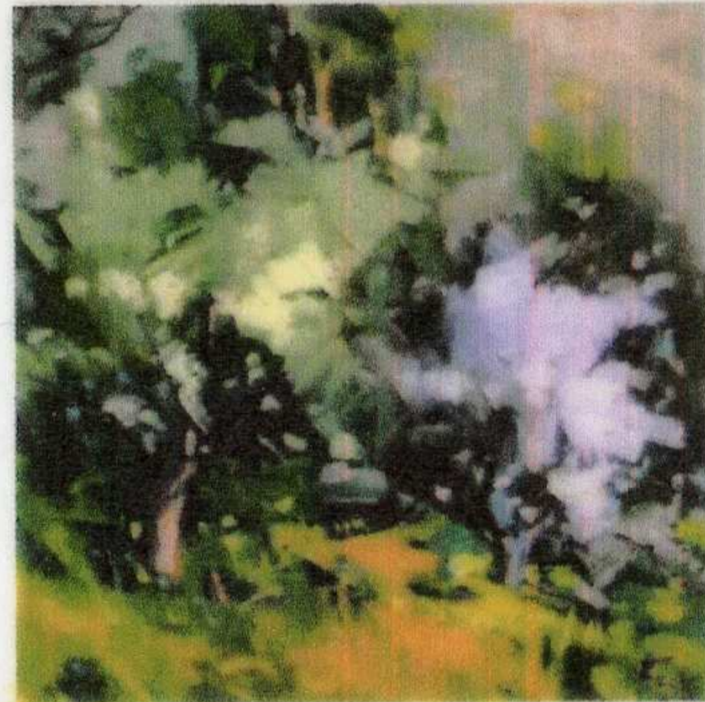
Apple Trees Oil on panel 30 x 30cms