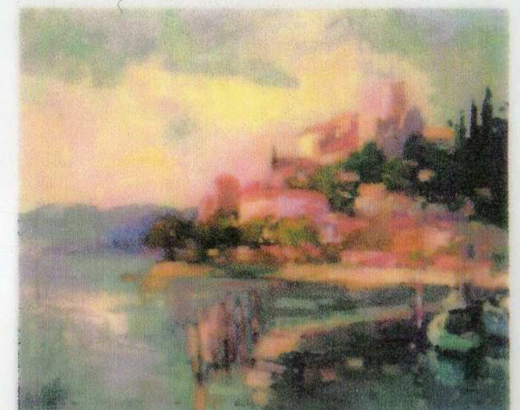
At Lago Trasimeno, Tuscany Oil on canvas 50 x 60cms