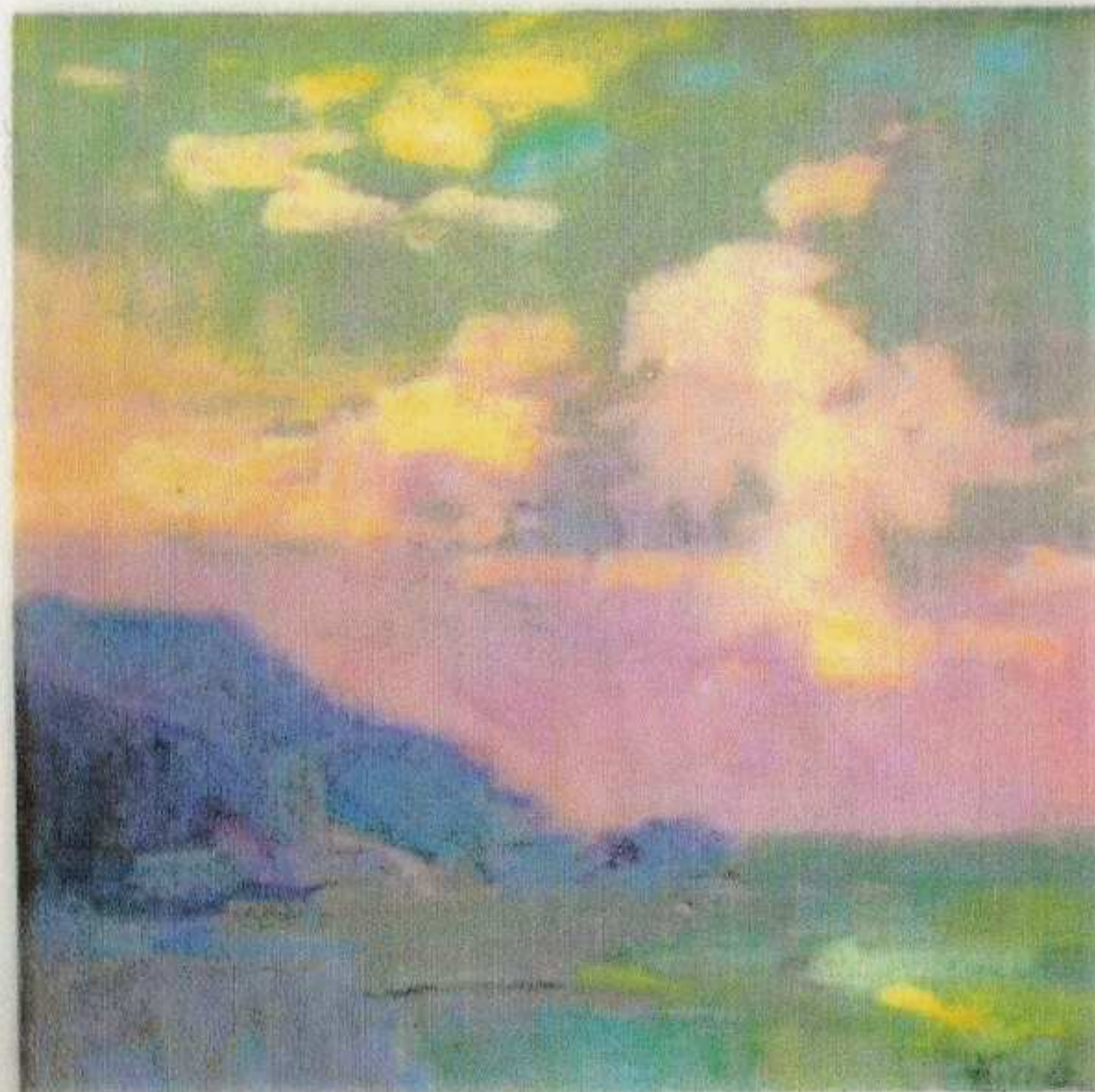
Evening Clouds at Lingre Ferce Oil on panel 35 x 35cms

To view all the paintings exhibited go to www.bebbfineart.co.uk