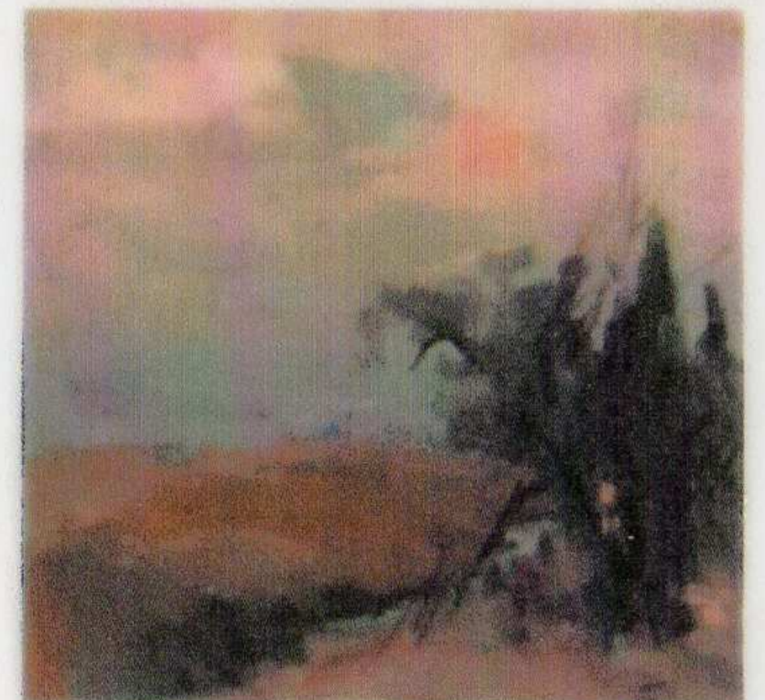
Dawn in Tuscany Oil on panel 30 x 30cms