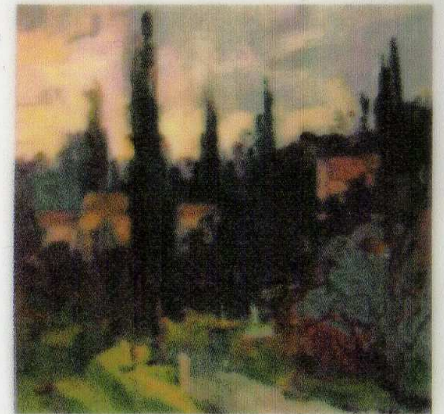
Landscape near Liena Oil on panel 30 x 30cms