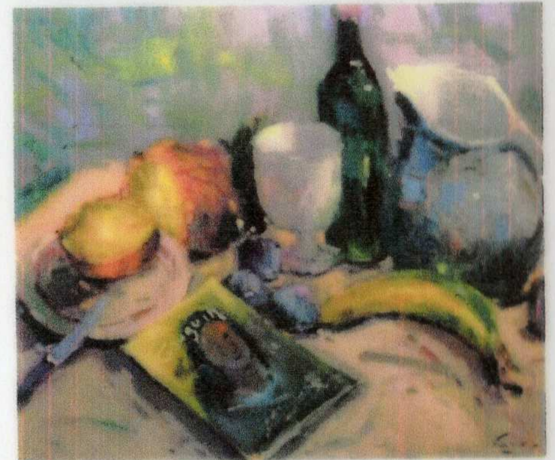
Gauguin's Fruits Oil on canvas 70 x 80cm

1 CHURCH STREET, LUDLOW SHROPSHIRE SY8 1AP TEL: 01584 879612