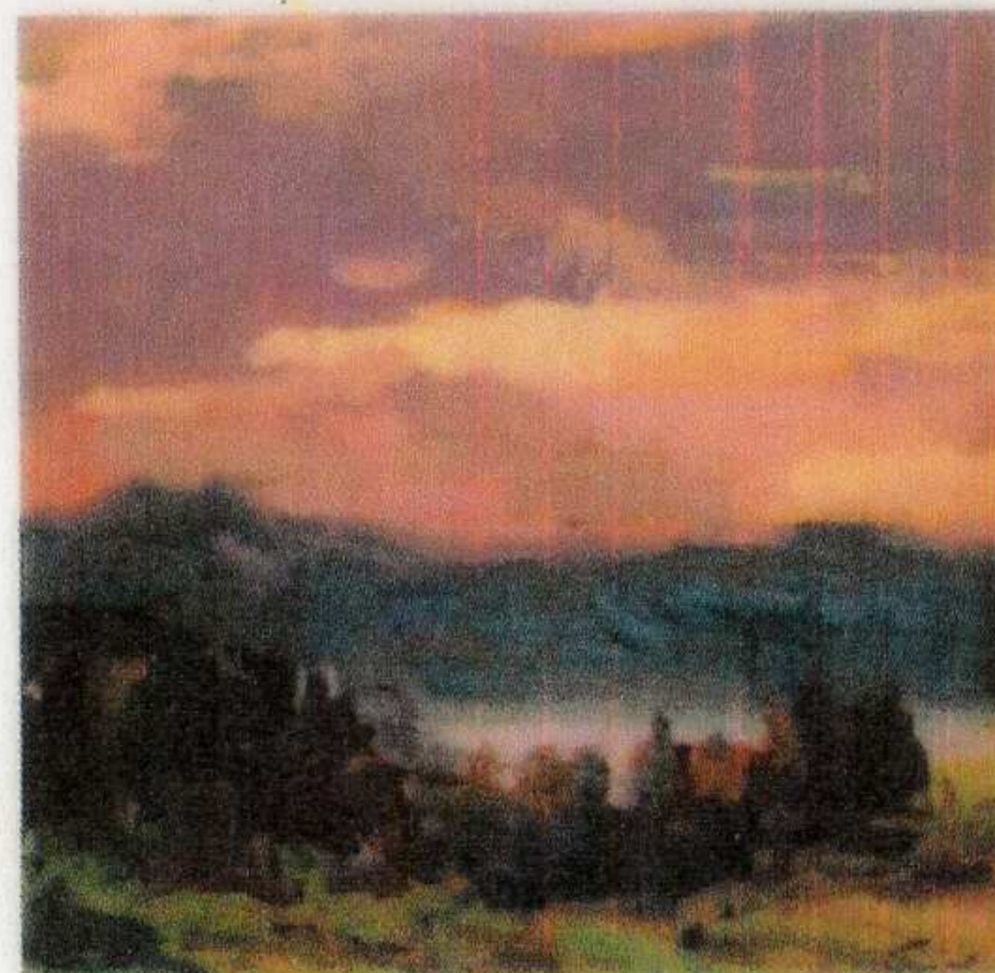
Sunburst Oil on panel 30 x 30cms www.bebbfineart.co.uk

Printed by Reprodex Printers Ltd., Hereford